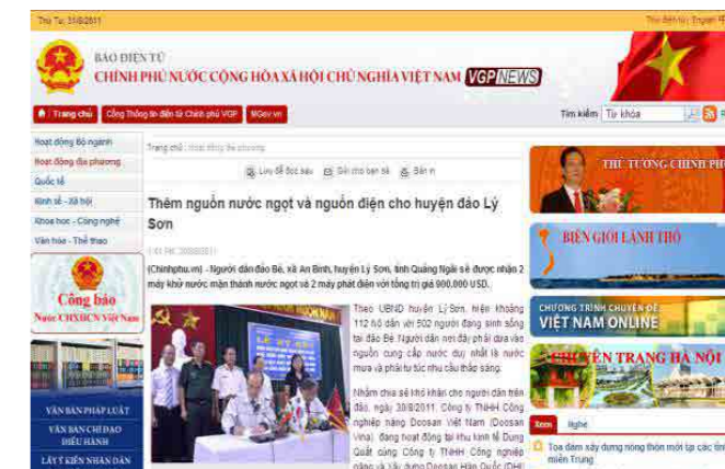
Donate desalination plant to An Binh Island (Government website)