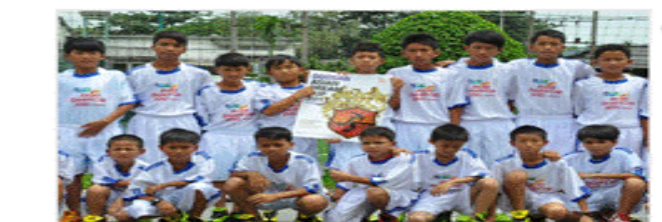
Invite Quang Ngãi Youth Football Team attend in DADC (Government newspaper)

Trận đấu của Doosan Asian Dream Cup lần thứ nhất khai mạc lúc 18 giờ thứ Tư (15h) tại sân vận động Thống Nhất TP HCM. Trận đấu diễn ra giữa Navibank Sài Gòn và các cầu thủ bóng đá chuyên nghiệp đến từ khắp nơi trên thế giới.