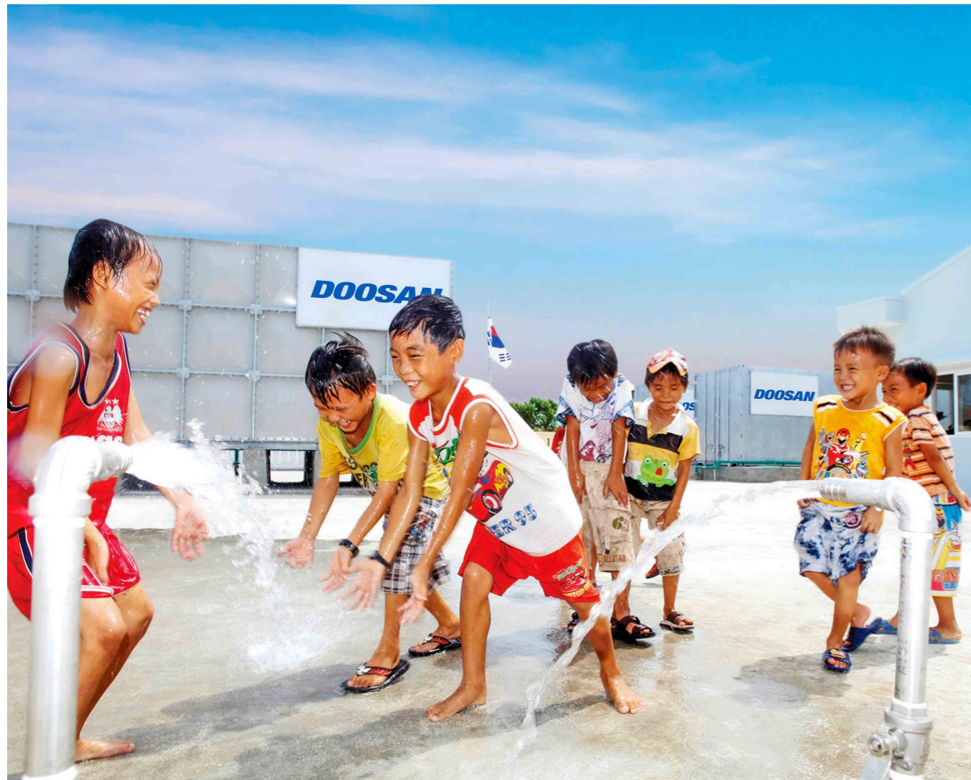
Children of An Binh Island are happy with playing in the water supplied by Water Facility that DOOSAN VINA donated on August, 2012. They used to rely on only rainfall when they needed water.