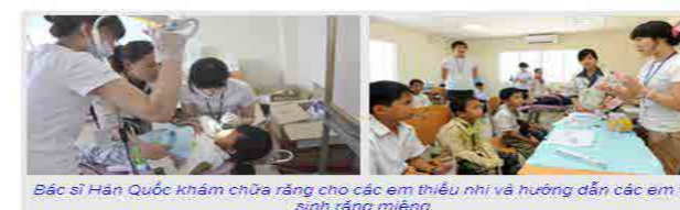
Bác sĩ Hàn Quốc khám chữa răng cho các em thiếu nhi và hướng dẫn các em vệ sinh răng miệng.

Chỉ trong 5 ngày từ 25-29/7, các y bác sĩ của Bệnh viện Đại học Chung Ang đã khám bệnh và cấp thuốc cho khoảng 2.000 người đến từ các xã khu Đông huyện Bình Sơn.