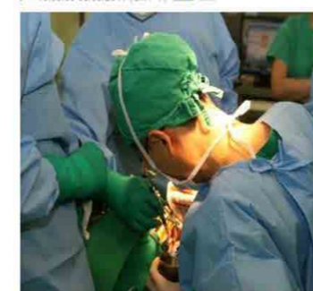
Cả phẫu thuật thành công

Doosan Vina - tổ hợp sản xuất công nghiệp nặng thuộc Tập đoàn công nghiệp nặng Doosan Hàn Quốc - tại Việt Nam, đã hợp tác cùng Bệnh viện - Đại học Chung Ang, hỗ trợ chi phí trị giá 55.000 USD cho 5 em nhỏ ở tỉnh Quảng Ngãi bị hở hàm ếch sang phẫu thuật tại Hàn Quốc.