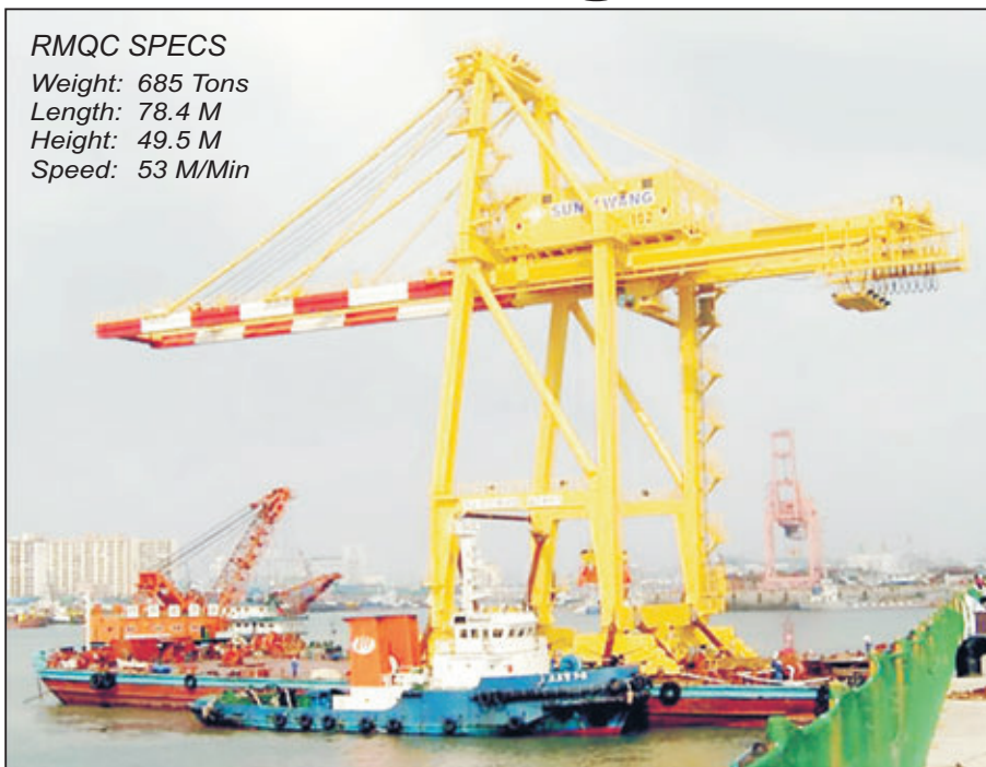
A Rail Mounted Quay Side Crane (RMQC), similar to the ones that will be produced for the Samarinda, Indonesian contract, is loaded on a barge for shipment.

ing forward to demonstrating their skills and showing everyone exactly what they can do!" The scheduled date for site deliv-