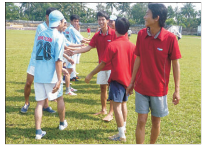
Teams shake hands after the match

team's goalkeeper said: "I appreciate the efforts and skills of the EHS team. They played really well and they deserved to be the winner. The main purpose of this ange experience between match.