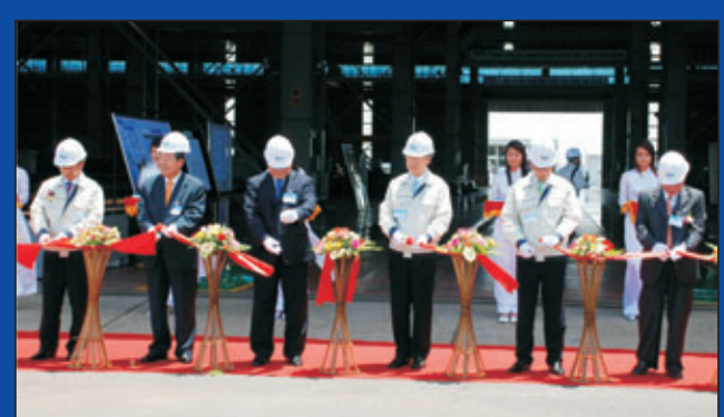
VIPS cut the ribbon to officially open Doosan Vina!