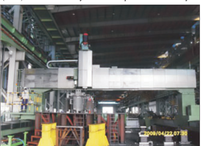
Note the man on the left to get a sense of the size

Size is only one of the special features