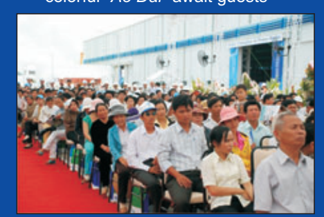
Over 1,000 guests attended the opening