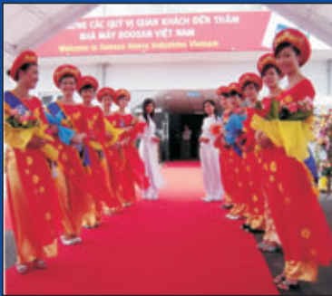
Receiving line of lovely ladies in colorful "Ao Dai" await guests