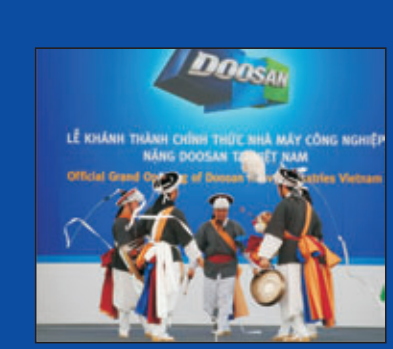
Korean traditional drum corps opens the ceremony.