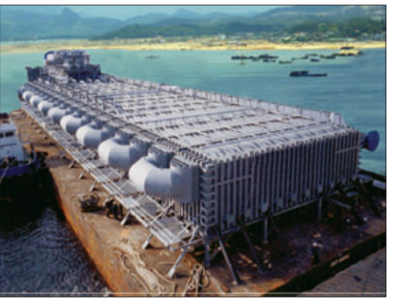
A completed Unit is shipped out construction is the first such large scale evaporator produced in VietNam is giving purpose, pride and providing the motivation to the whole team at Dessal.

Go team, we are all supporting you and look forward to the completion of our first "Made in Vietnam" evaporator.