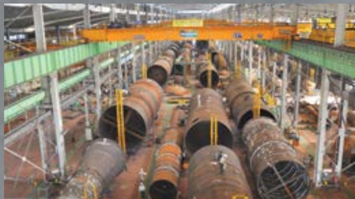
View of a bay at the CPE shop

The Manufacturing Engineer Team is divided into two lines: The ME Line is responsible for welding certification management, Welding Process Specifications, Certification of Welding Processes, Estimation of welding materials, Control of welding quality, Welding training, Welding material inventory management and more. The Design Line designs and issues: the drawings, Bill of Materials for purchase and support/process any problems that arise from drawings. The Design Line of CPE is equipped with the most advanced and up-to-date software and has completed the design of three major projects entirely in Vietnam.