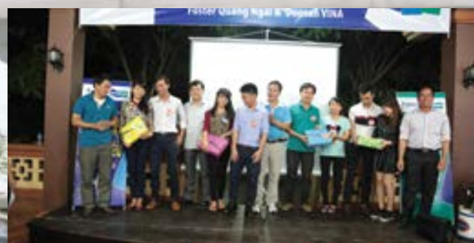
Excellent couples are recognized