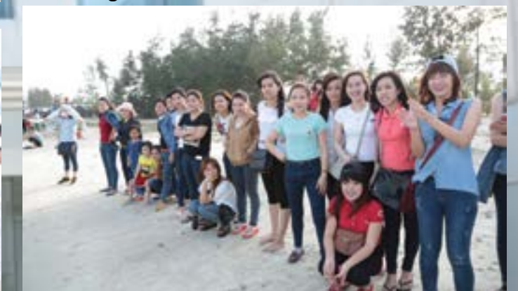
Cheering their friends on