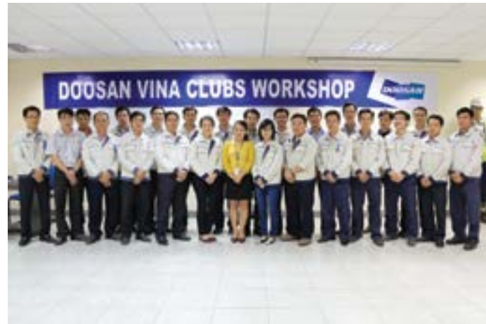
Club members at the Workshop

There were 33 members in attendance that were broken into two groups so that they could share and discuss ideas for their clubs operation in 2015. After four hours of discussions a total of 69 ideas were collected and presented to the participants. Based on those ideas, OC reviewed and made recommendations to help the clubs operate more effectively.