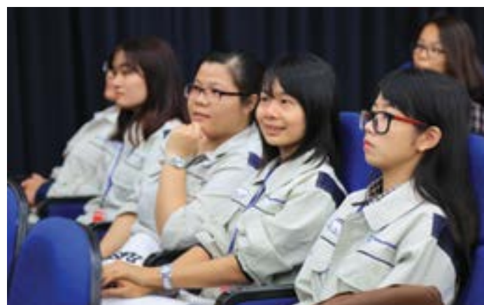
Interns & Mentors listen to presentations

During the internship at Doosan Vina, all students were supported with meals, housing and subsidized 500 thousand vnd/month/student by Doosan Vina.