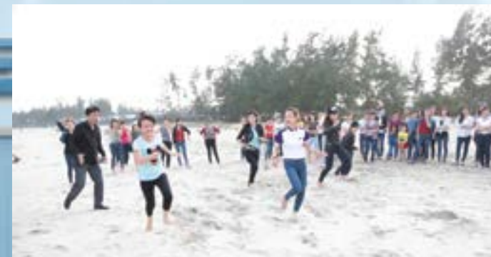
Sand race on the beach