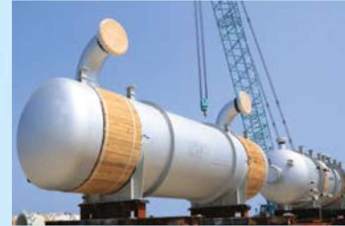
CPE high tech pressure vessels awaits shipment

petrochemical products such as polypropylene and polyethylene terephthalate (PET) and associated feedstock.