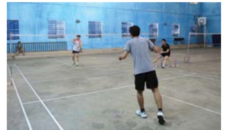
The players exhibit their skill and strategy