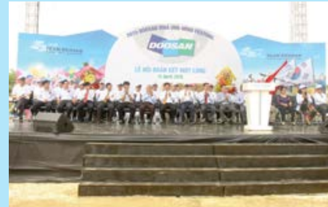
Guests and Doosan Vina management at the Festival opening

Division take home the first place award in both the Games and Entertainment categories, Water won the coveted 5th Football Championship Cup, the PSD Division took the Volleyball Champion Cup and hundreds of lucky draws and prizes were awarded to employees during the course of the day.