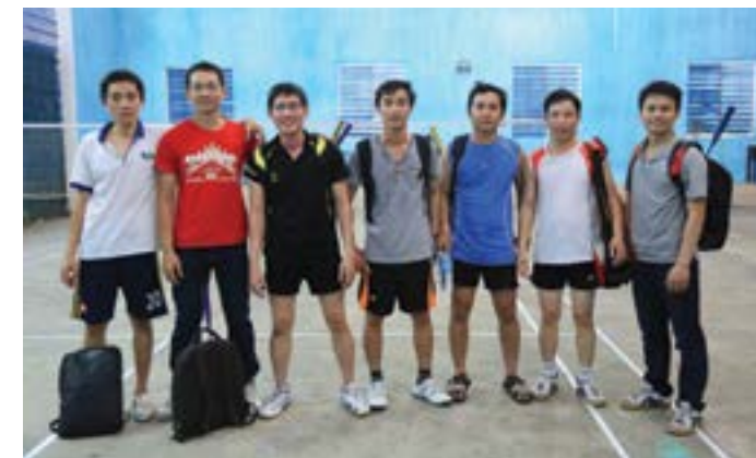
Badminton Club players after the tournament