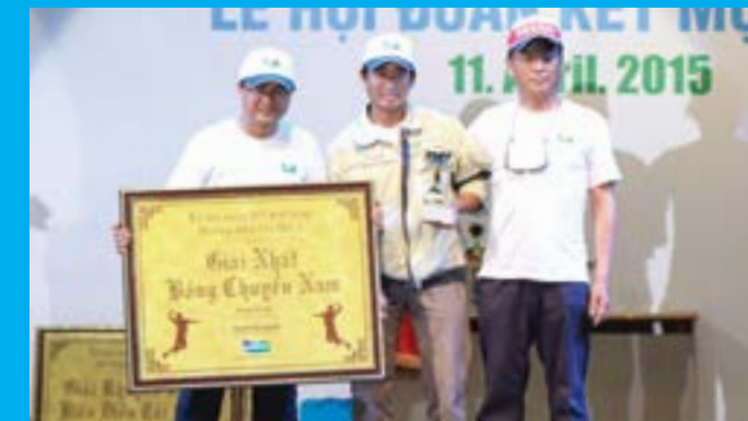
PSD takes First place in Volleyball