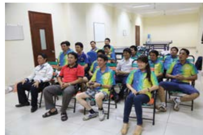
Table tennis's players listen to the competition's rules