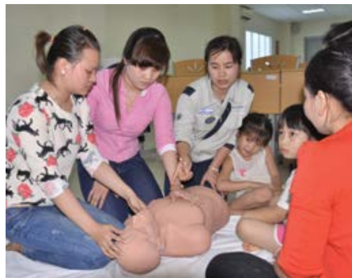
Teachers practicing CPR on a dummy

Doosan Dream Kindergarten was established in April 2012 to keep and take care of employees' children. There are 79 children; three classes and nine teachers at the Doosan Dream Kindergarten.