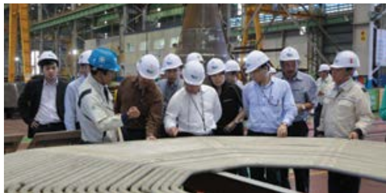
Visitors of Petro Vietnam on a shop tour at the Boiler shop

The leaders discussed the strategic partnership opportunities that were available and spoke of the potential for long-term cooperation on several key energy projects in Vietnam. They also reviewed the history between the companies that dates back to the early days of BSR and Doosan Vina when the company made much of the equipment needed to open Vietnam's first refinery.