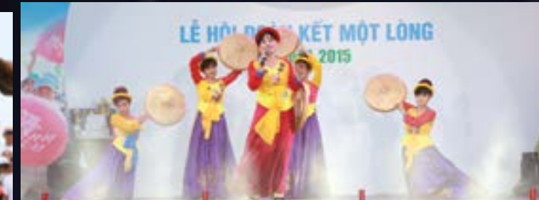
Performance by Mai Linh Taxi