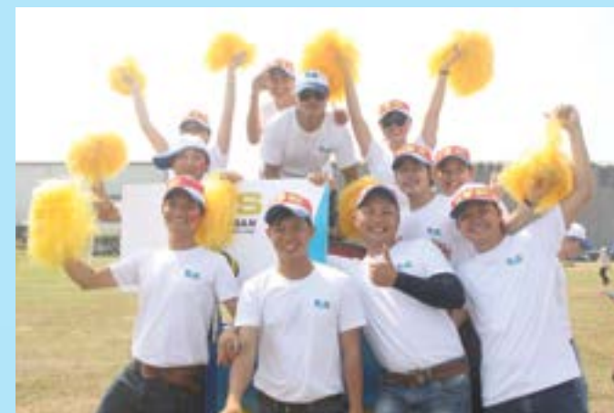
Fans of the MHS shop