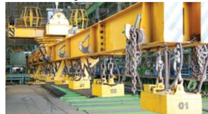
A heavy lift crane system in one of the five shops