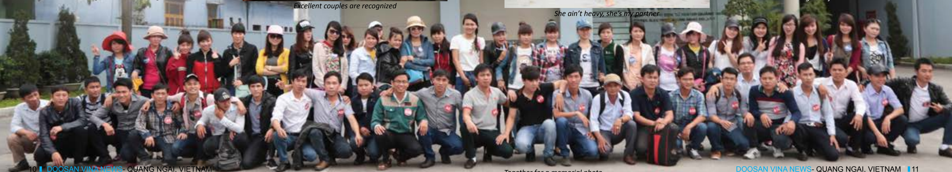
Together for a memorial photo