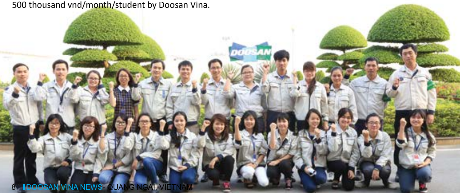
12 Interns & Mentors pose for a memorial photo