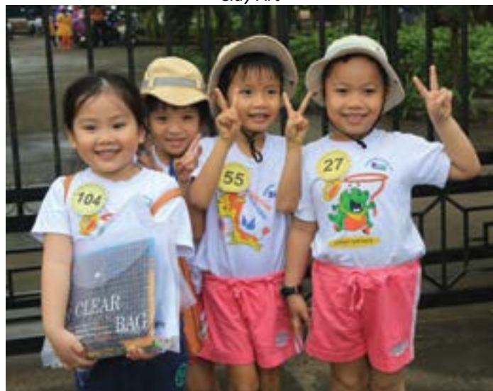
Four smiling children from Doosan Dream Kindergarten at the competition