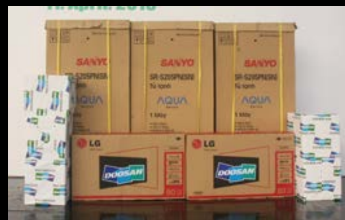
Many great lucky draw prizes