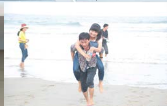
She ain't heavy, she's my partner

28th at My Khe Beach, a popular recreation area in Central Vietnam's Quang Ngai Province, where all the lucky participants were assembled in anticipation of what may lay on the other side of the "bridge."