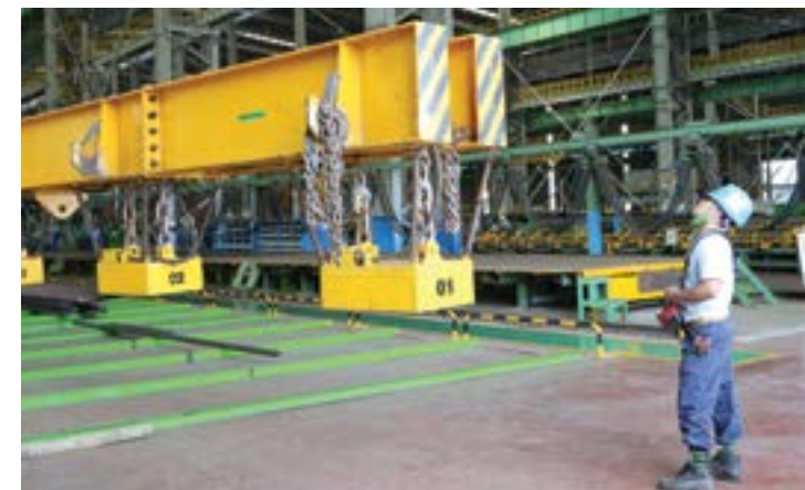
A high tech remote control crane

Through this practical training course, employees had the opportunity to understand the operational skills as well as be able to handle the situation safely and efficiently to ensure safety during operation.