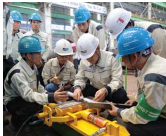
CEO visits the Best keson of Boiler shop

QAD (2) A hydraulic system created for the edge of an Erosion Shield - Coil Fabrication 4 team, BLR (3) A lifting Jig and alignment for the support inside a shell to prevent accidents and reduce the time it takes to fit-up a support beam in vessel – Fabrication 3, Water (4) A jig for fit-up HL and HU - Harp Welding 1 team, HRSG (5) a Jig fit-up to eliminate the markup step and reduce the time to attach Stub-bolts - Fabrication 3 - Part 4, MHS.