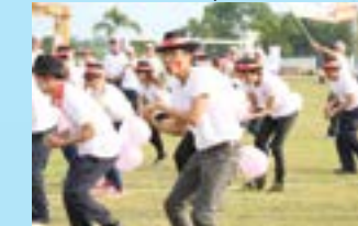
Fans of QAD & EHS