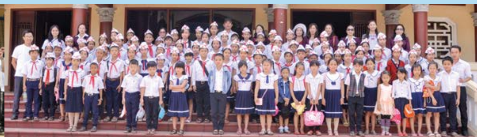
A group of students and teachers with Doosan Vina's volunteers at DDCS