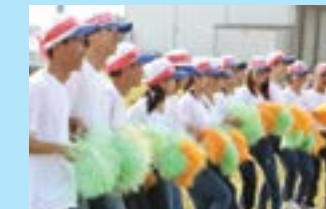
Fans of FSD