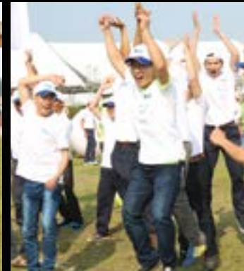
Enjoy the win