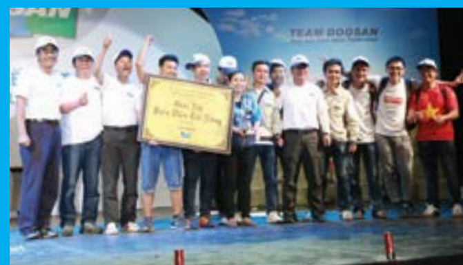
Second Place – HRSG