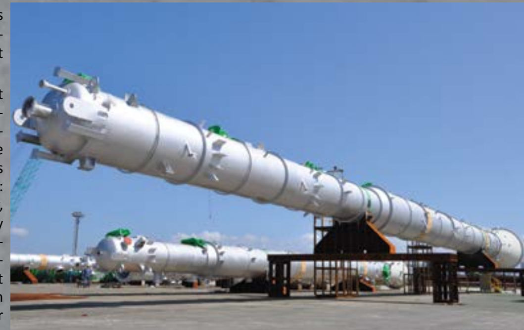
The super weight and long products look like spacecraft

In addition to the large volume of production, the