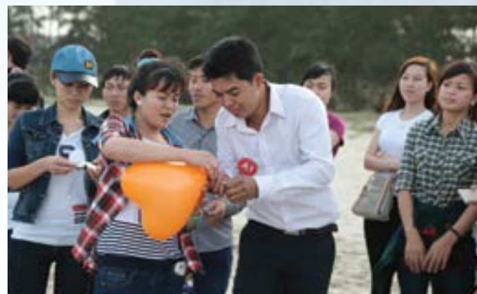
Preparing balloons for a game