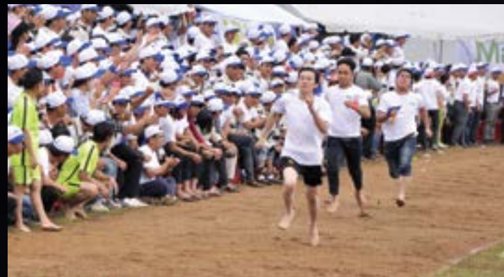
Trying to close the gap