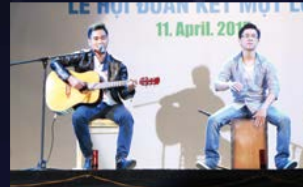
"Forever" by Music Club