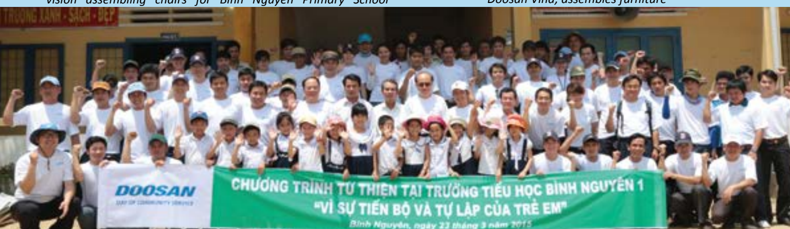
Doosan Vina's volunteers and Binh Nguyen Primary School's pupils