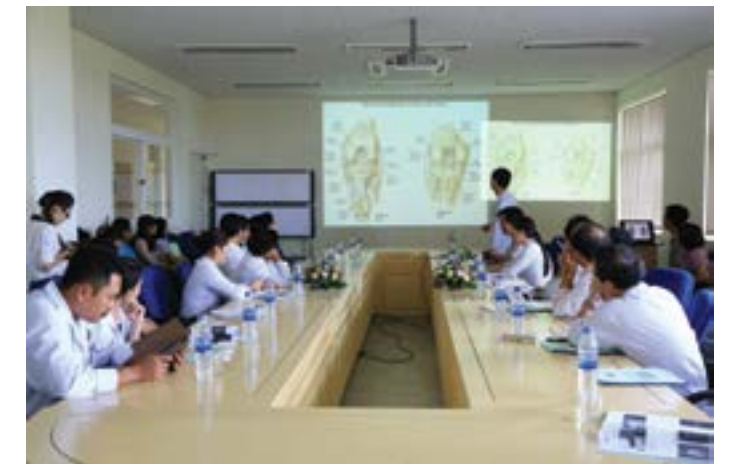
Doctors and staff meet to discuss plans