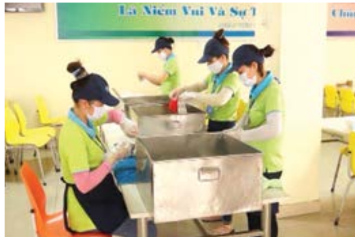
Probanks staff prepare lemon juice

to the job site to replenish vitamins and minerals lost in the hot weather and to help improve resistance to heat related illness.