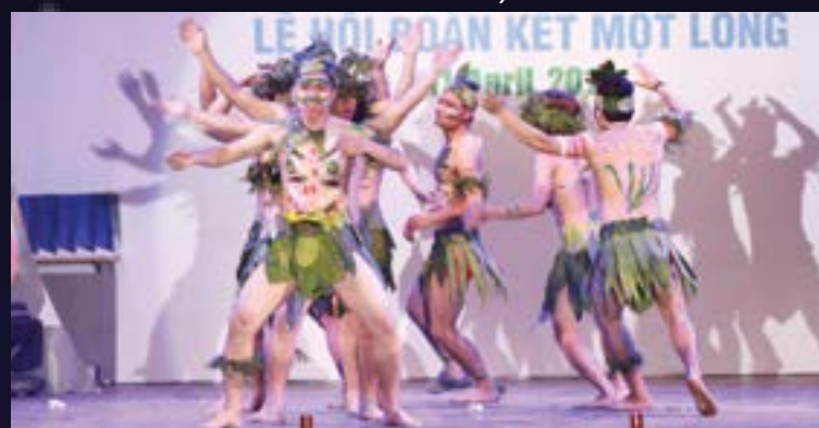
"Tai Tu Vung Cao" by HRSG