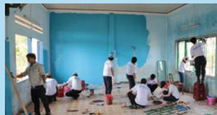
Volunteers paint a classroom