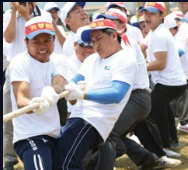
Tug-of-war requires strength