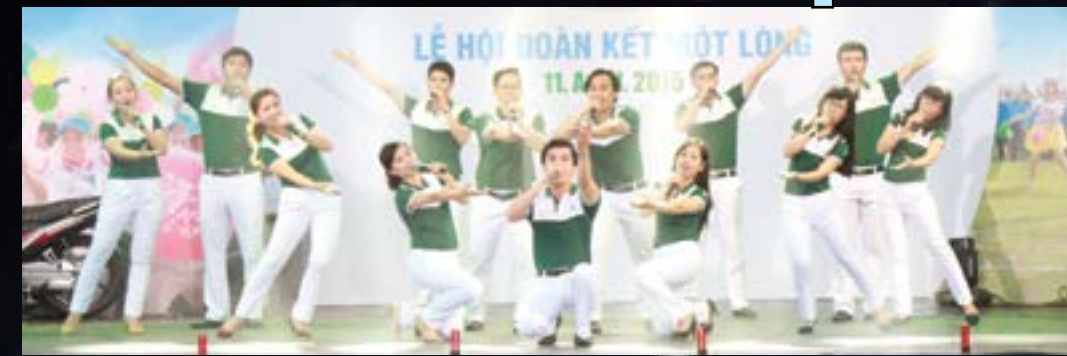
Performance by Vietcombank Quang Ngai