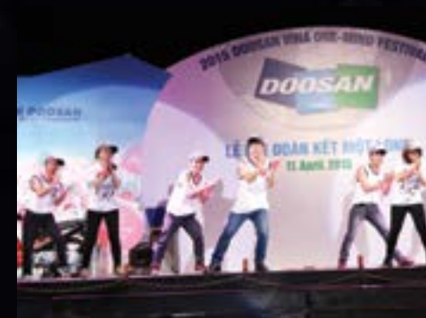
"Vu dieu EHS" by EHS