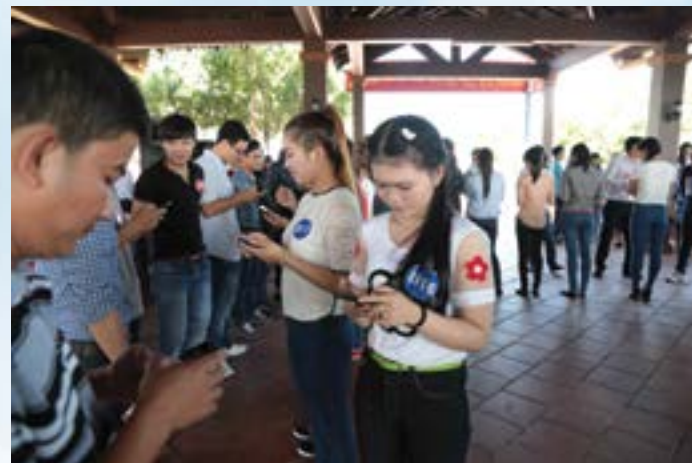
Exchanging phone number's

The fun started at two in the afternoon of March