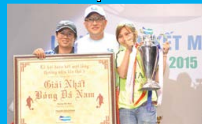
Football Championship Cup went to the Water shop