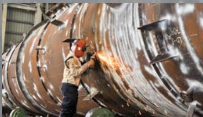
A grinder works on a CPE shop product

The Production Control Team is responsible for making quotes, researching projects, budget management and cost projections, managing internal transactions, supplying material for the Production Team, regulating the manufacturing, meeting with the customer on progress of the project and processing production issues that arise related to the project.