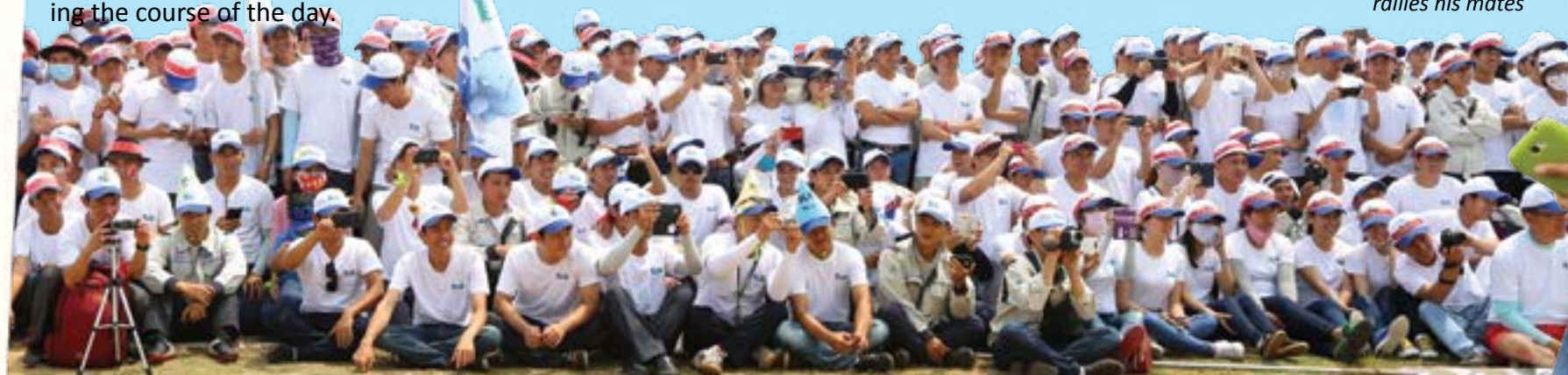
Some of the 2500 people who attended Doosan Vina's Fifth Annual One Mind Festival