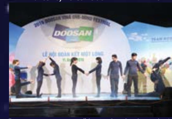
"Su Ket Hop Hoan Hao" by OE & Sales & Marketing