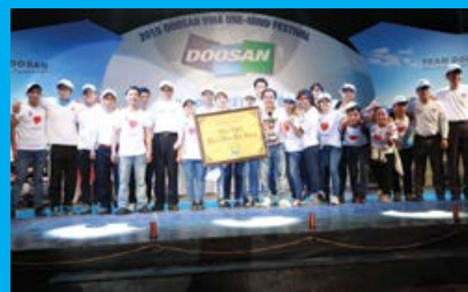
First Place – Boiler