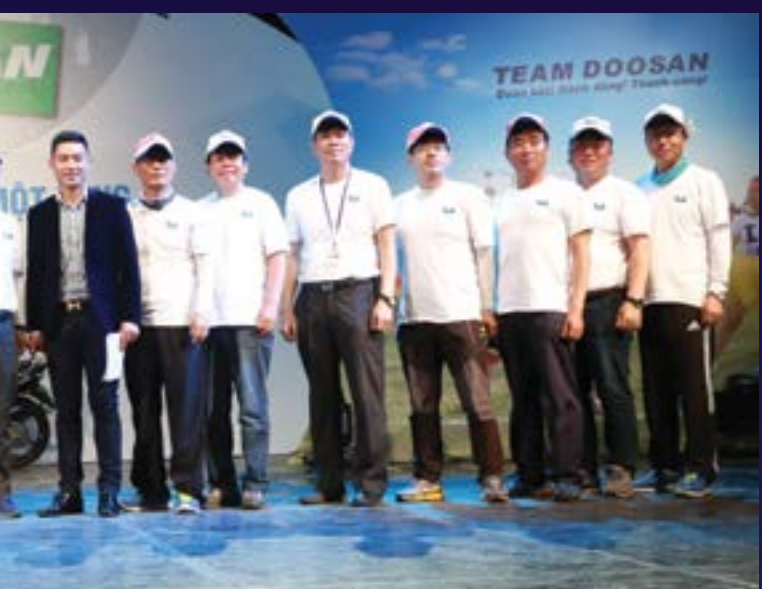
and MCs at the closing