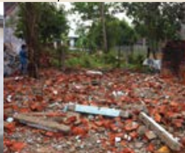
During the renovation