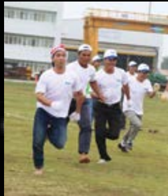
Race for the rope in "Tug of war"