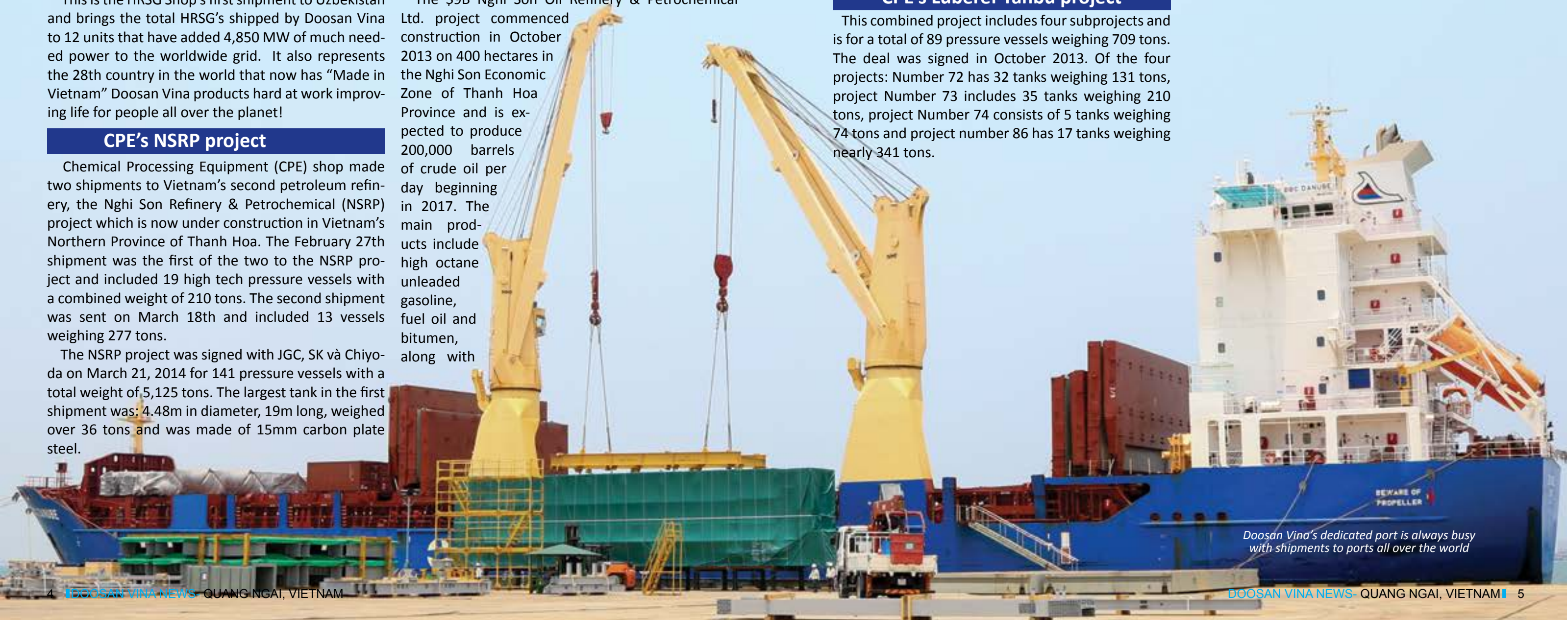
Doosan Vina's dedicated port is always busy with shipments to ports all over the world