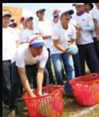
Tossing water balloons at the boss