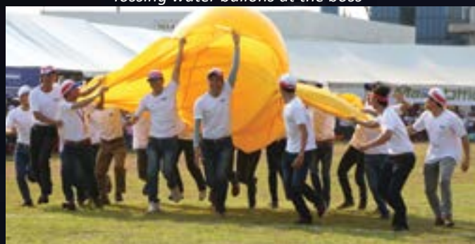
Follow the bouncing ball