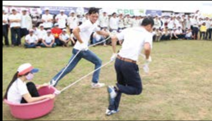
A two horse open sleigh