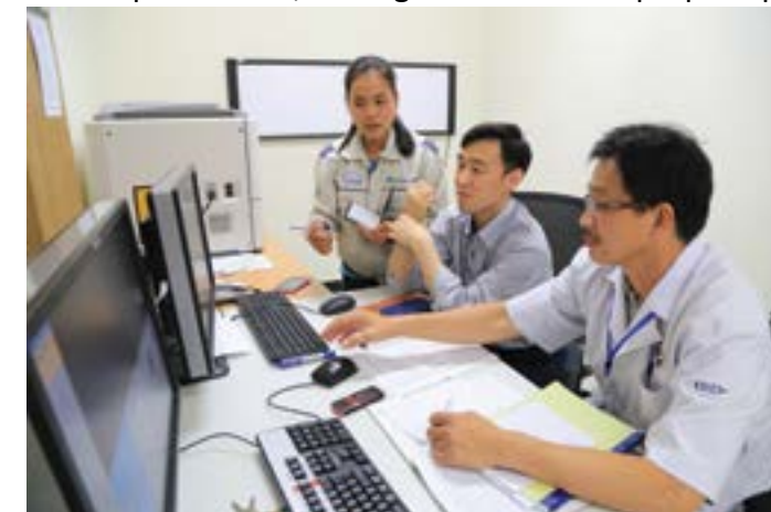
A training session on administration work at the hospital