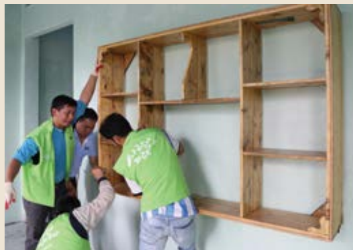
Doosan Vina volunteers install a new shelf built from recycled packing material by Packing and Shipping