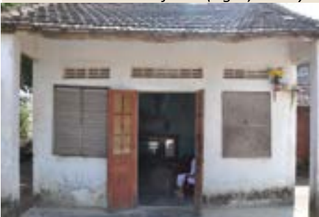
Before the project began