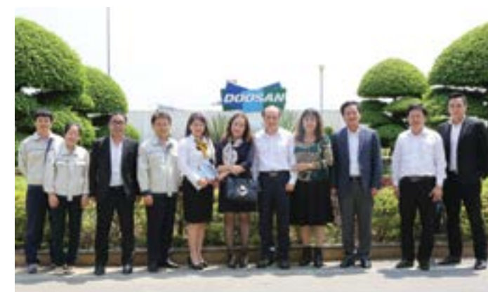
Doosan Vina's CEO and visitors of Vietcombank