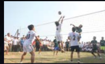
Volleyball Final between PSD & Water