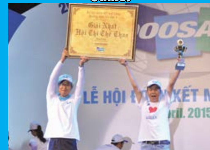
First Place for games – Boiler