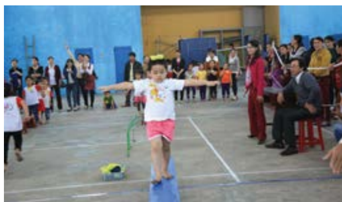
Dam Viet Phu in the team game