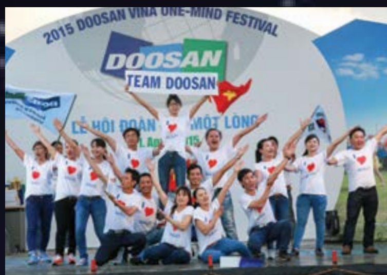
"Boiler's Got Talent" by Boiler