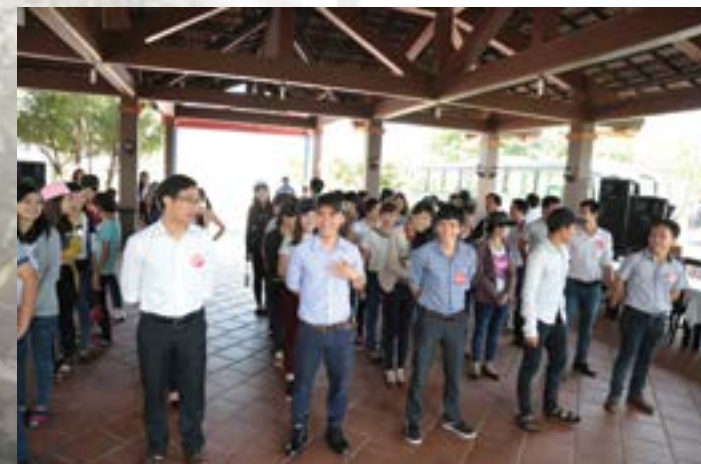
Over 60 participants from Doosan Vina and Foster came together to build bridges