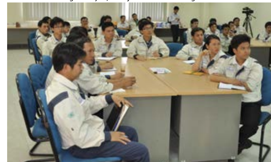
A training session in progress