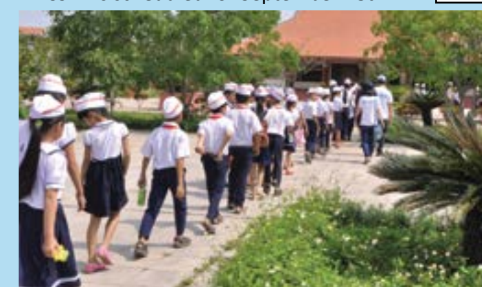
A tour of memorial of former Vietnamese Prime Minister and Quang Ngai native, Pham Van Dong in DDCS