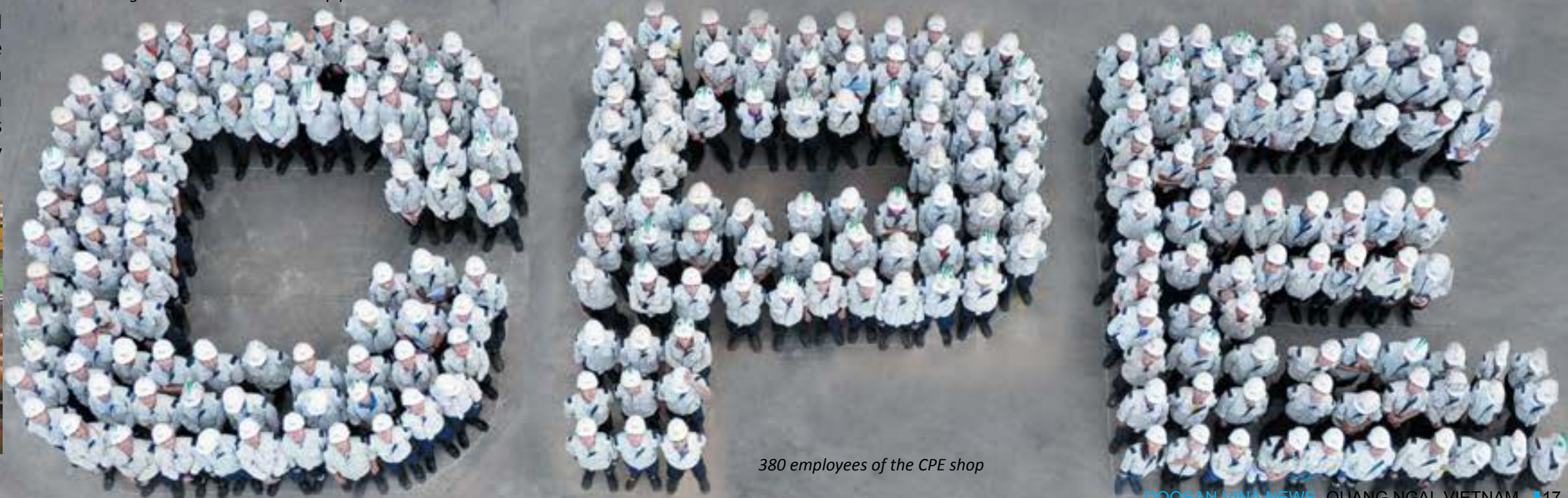
380 employees of the CPE shop

The CPE shop has a reputation among its many satisfied customers of being a dependable and quality supplier of the world's most advanced, safest and reliable Chemical Processing Equipment available today.