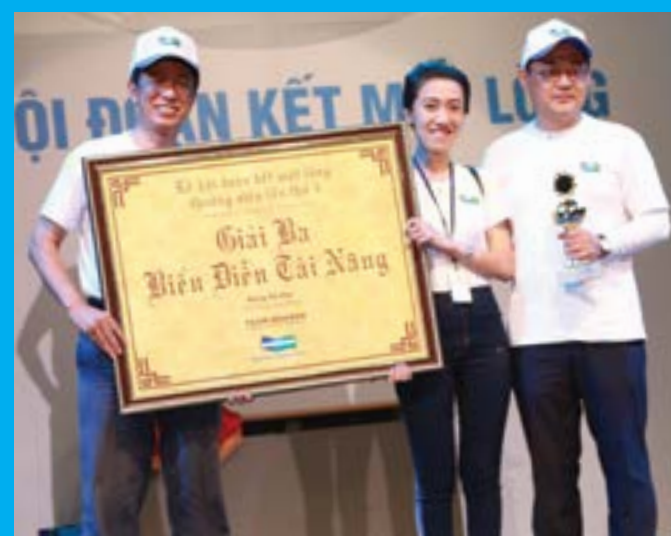
Third place – Financial Division