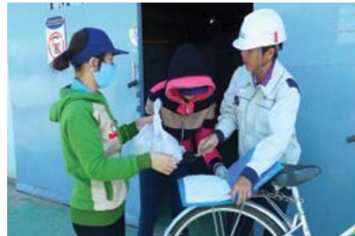
Delivery of the lemon juice to the work site