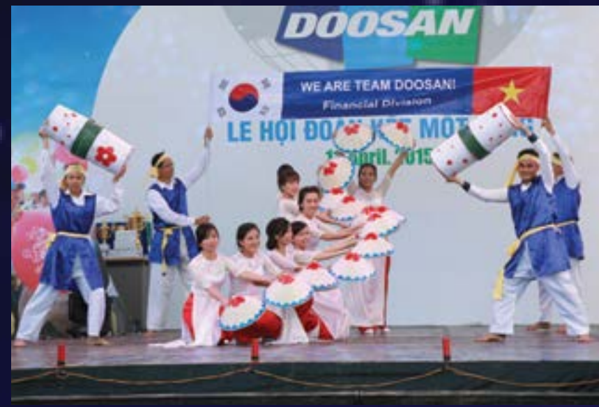
"Mua Truyen Thong Han Viet" by Financial Division