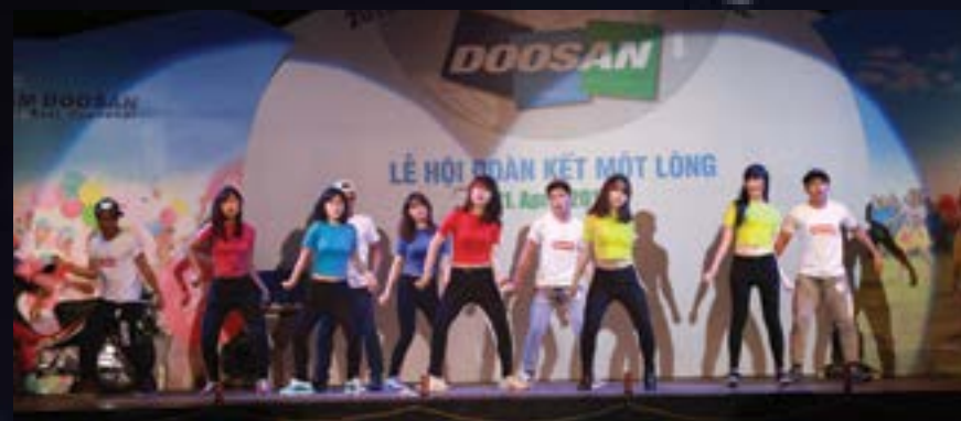
"Up and Down" by Main Office