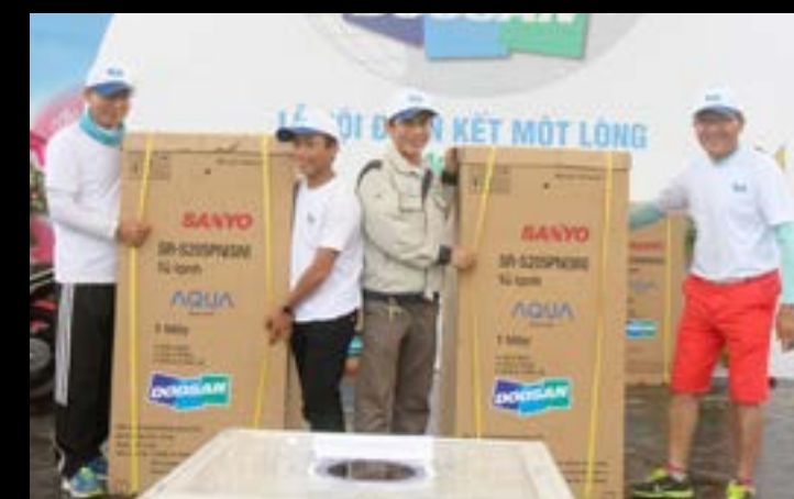
Two Fridges presented to lucky employees